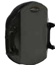
JETSTREAM PRO® BACK SUPPORT SYSTEM

FOR ADDITIONAL INFORMATION, PLEASE CONTACT: